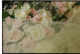
The veil across the bouquet adds another dimension.